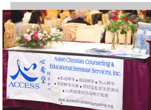
ACCESS Banner at 5th Anniversary Celebration Check-in Table